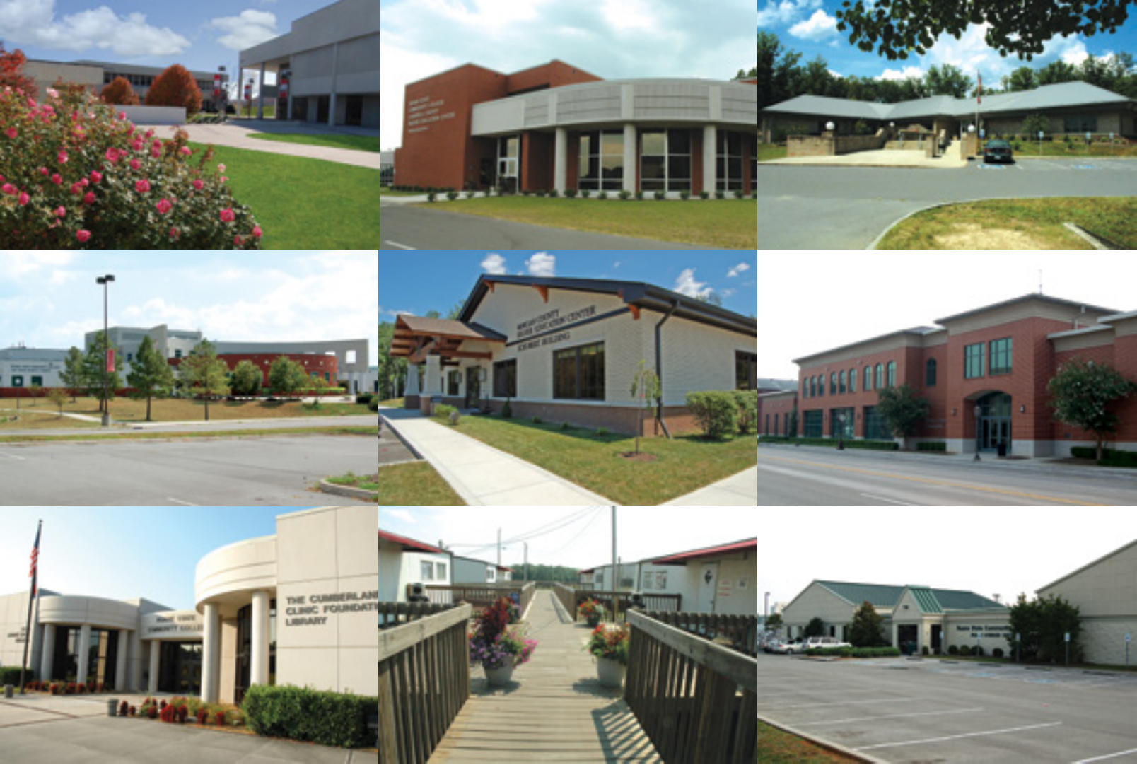
Above, top row, left to right: Roane, Campbell, Scott campuses. Middle row, left to right: Oak Ridge, Morgan, Loudon campuses. Bottom row, left to right: Cumberland, Fentress and Knox campuses.